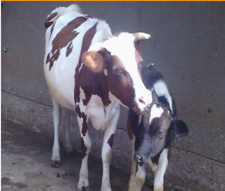
From left: the famous ' Matilda' cow with her new calf; chicken layers and the fishpond