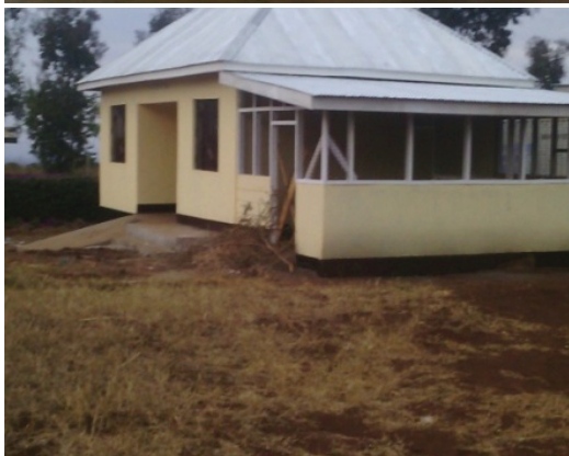
Above are the maize milling and sunflower machines and working / storage building