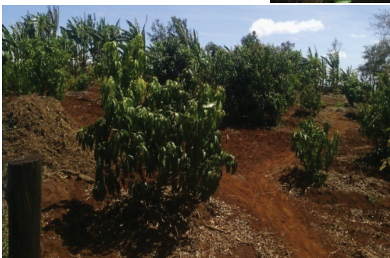
The horticulture garden - From left: bananas,, vegetables and the orchard with mango, pawpaw and avocado trees.