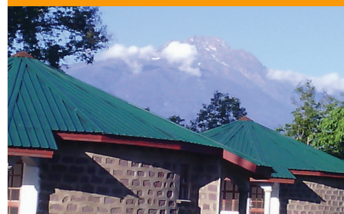
A view of Maktau Mountain View Lodge; below is the visitors recreational building.

The Lodge is also made of four rotunda-like structures with four rooms each which together will accommodate up to 16 guests at a time. The lodge also has a dining and lounge building for drinks and meals and besides a swimming pool is planned to allow visitors to enjoy the sometimes dry and hot environment in that area.