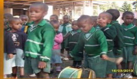
The kindergarten children preparing for classes at the Centre and also admiring the donation of school materials from the student of St. Patrick's School, Queensland, Australia.

All the primary school children are at boarding school and the total number of children who are receiving primary education is 26. Five more children are expected to enter primary education in 2013. The cost per child per year is US$1,000 (or TShs.1,600,000/=). With the review of fees by schools every year, the Centre will struggle to provide continuous education for their current primary students. This is especially why the Centre continues to look for sponsors so that the education foundation of these children is maintained.